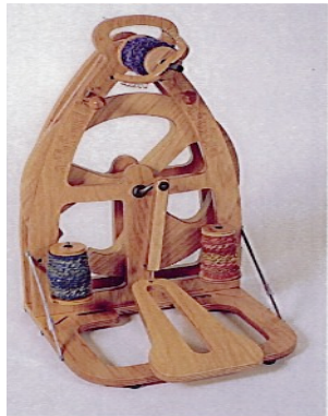
The Joy Wheel

Folding portable Lacquered Single treadle $560.00 Double treadle $615.00