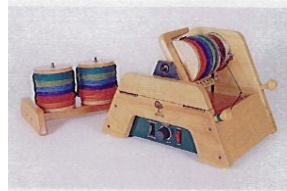
The Electronic Spinner

Kiwi Skein winder Free standing ...$91.00